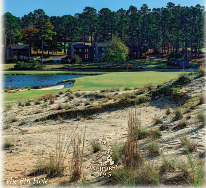
The 8th Hole